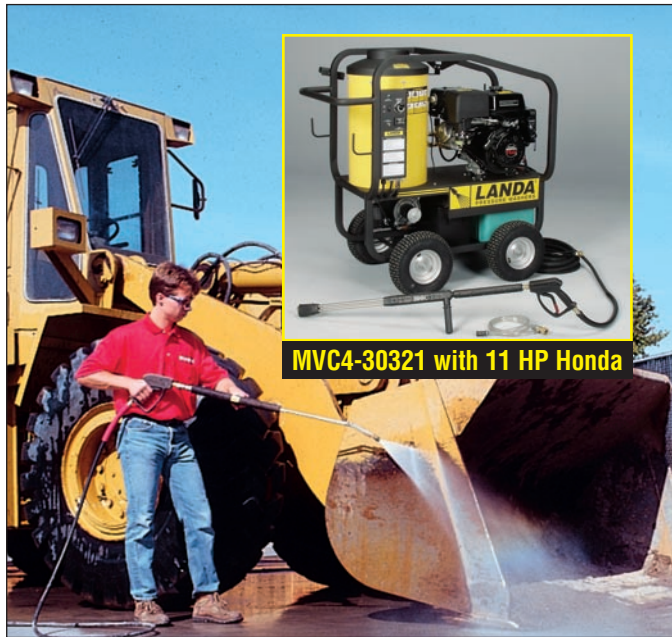
MVC4-30321 with 11 HP Honda