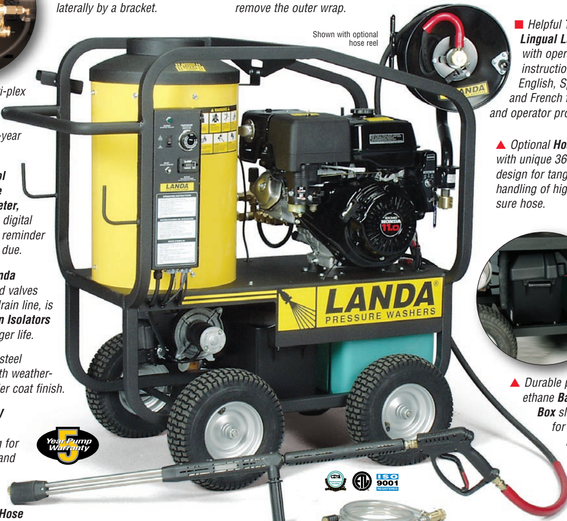
Shown with optional hose reel

▲ Durable polyurethane Battery Box slides out for easy access.